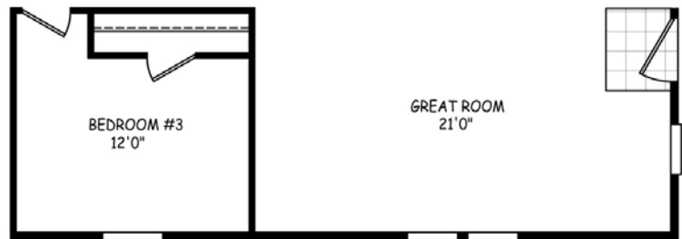
OPT BEDROOM #3 (REPLACES DEN) W/ALT FRONT DOOR LOCATION