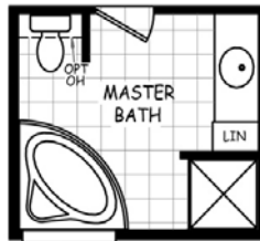
4648 OPT WINDOW OPT FLASH BATH