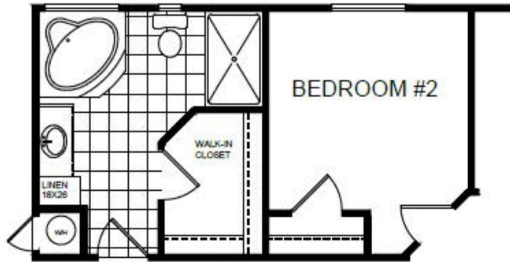
OPT. GLAMOUR BATH