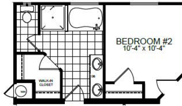
OPT. ELITE BATH